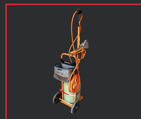
936 GAS BOTTLE TROLLEY