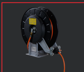
GAS HOSE REEL