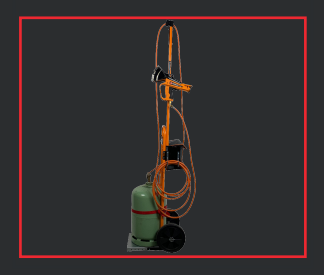
GAS BOTTLE TROLLEY