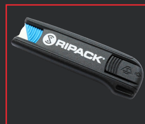
SAFETY CUTTER EASYKNIFE