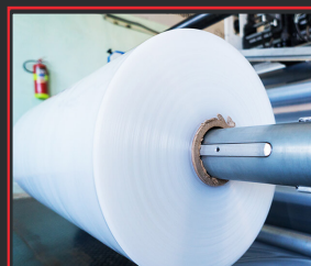
STANDARD PALLET COVER (80X120 AND 100X120)