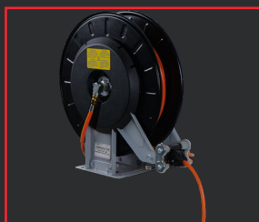
GAS HOSE REEL