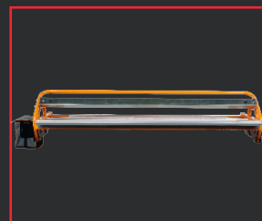
MULTICOVER SOLDERING HEAD