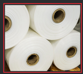
LARGE WIDTH FLAT FILM