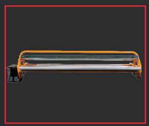
MULTICOVER SOLDERING HEAD