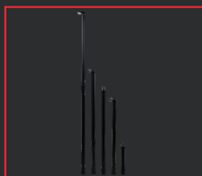
RIPACK SHRINK GUN EXTENSION POLES