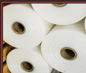
GUSSETED HEAT SHRINK TUBING