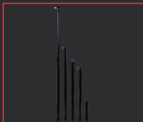
RIPACK GUN EXTENSION POLES