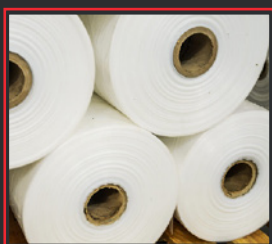
GUSSETED HEAT SHRINK TUBING (AVAILABLE FROM 4 TO 15 M WIDE)