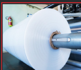
STANDARD PALLET COVER (80X120 AND 100X120)