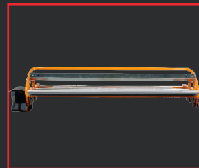
MULTICOVER SOLDERING HEAD